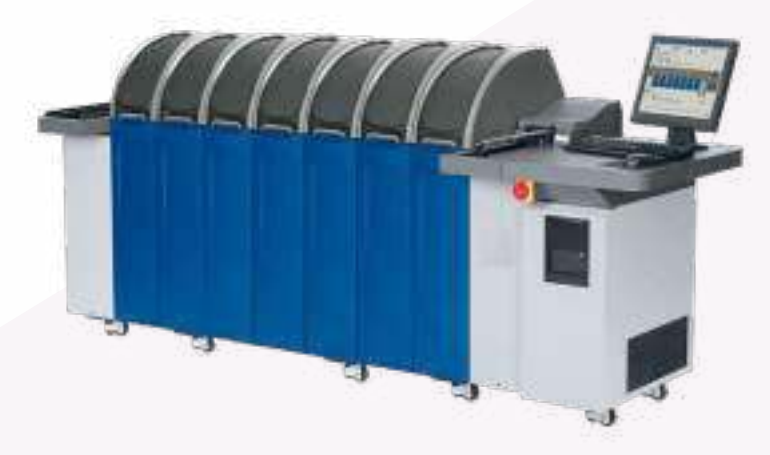
MX2100 Card Issuance System

Service and support: The MX Series Platform is supported by the industry's largest service and support network, which spans more than 150 countries worldwide. Online and phone support is available 24/7.