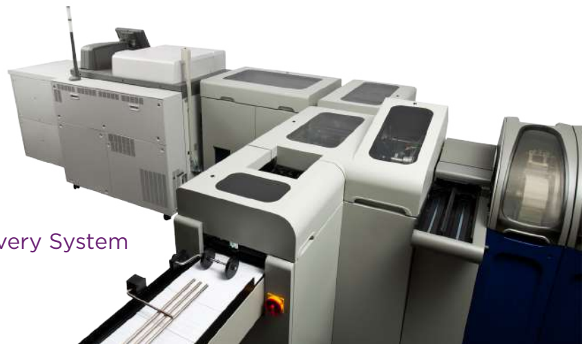
MXD610 Card Delivery System

Support market trends: Meet the growing vertical card trend without limiting job sizes based on card orientation. Dynamically place cards on carriers horizontally and vertically to meet customer requests.