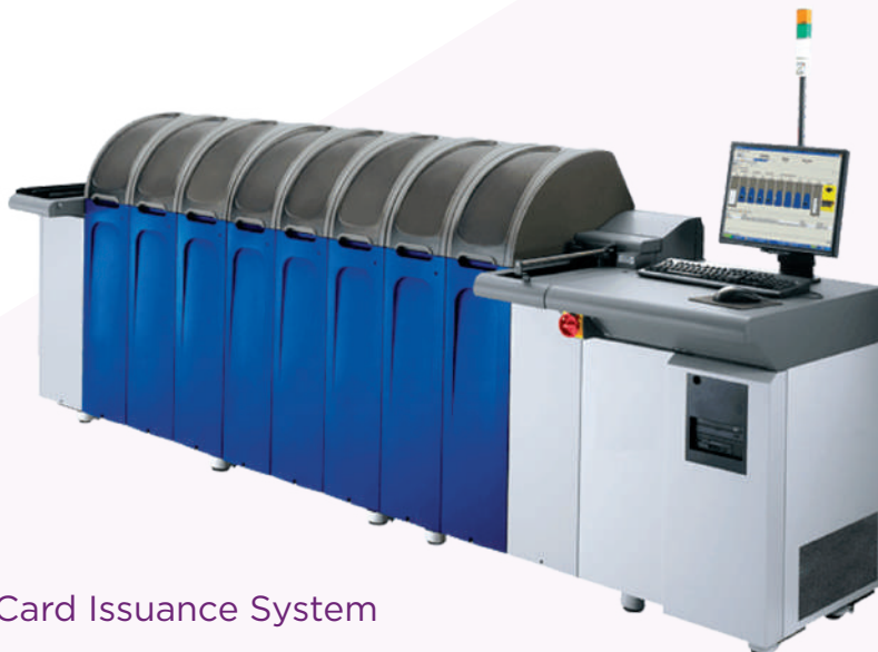
MX6100 Card Issuance System

Service and support: The MX Series Systems are supported by the industry's largest service and support network, which spans more than 150 countries worldwide. Online and phone support is available 24/7.