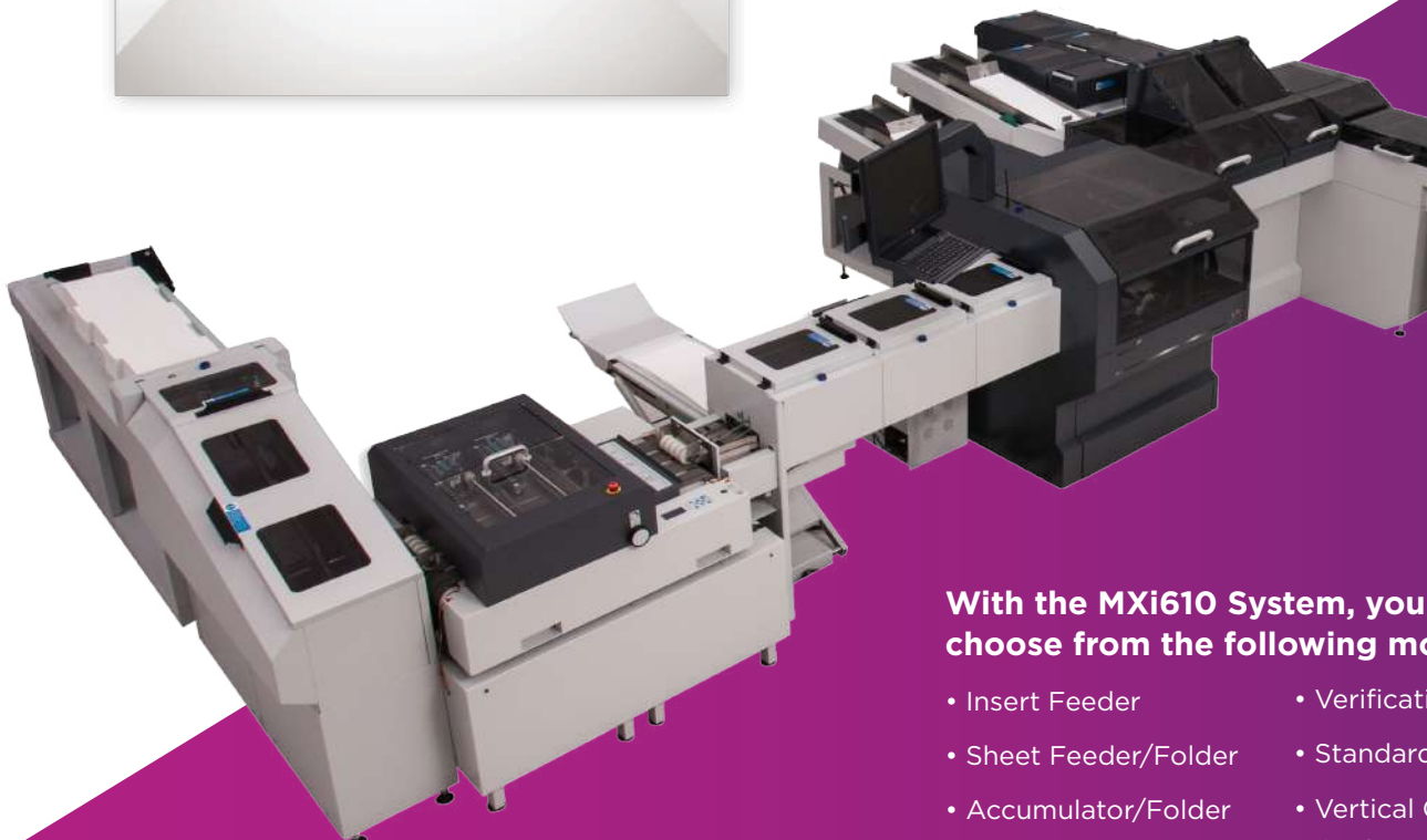
MXi610 Envelope Insertion System